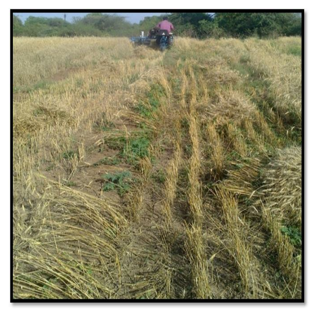
Plate 2 : Field evaluation of reaper. Table 2 : Performance evaluation of self propelled reaper binder

The testing of self propelled Reaper binder was carried out for harvesting of wheat crop on the Dr. P.D.K.V., Akola. The results of field performance summarized in table 2. The average plant height, row spacing, and height of cut were 70.4 cm, 45 cm and 22.6 cm, respectively. The mean values of forward speed, effective field capacity, field efficiency, fuel consumption