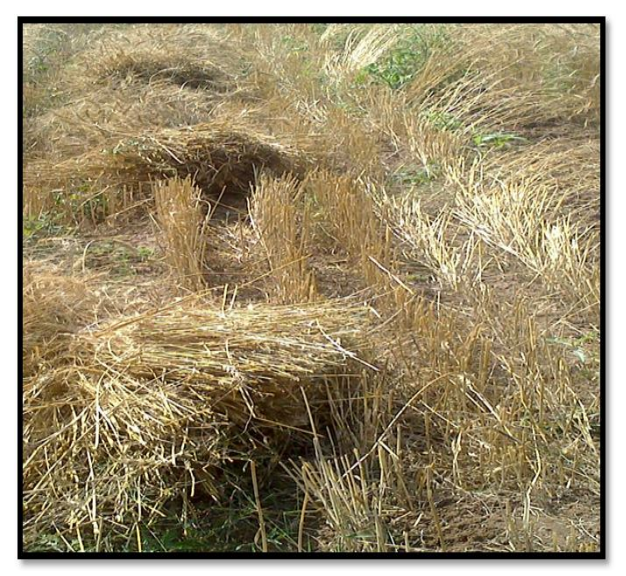
Plate 3 : Binding Bundles of wheat after harvesting.

and harvesting losses were observed 5.38 km/h, 0.716 km/h, 88.72%, 4.73 l/h and 1.70%, respectively.